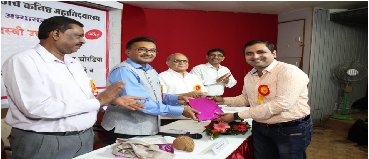
Dignitaries at the workshop conducted on "Sustainable Agrotourism Opportunities and Challenges"