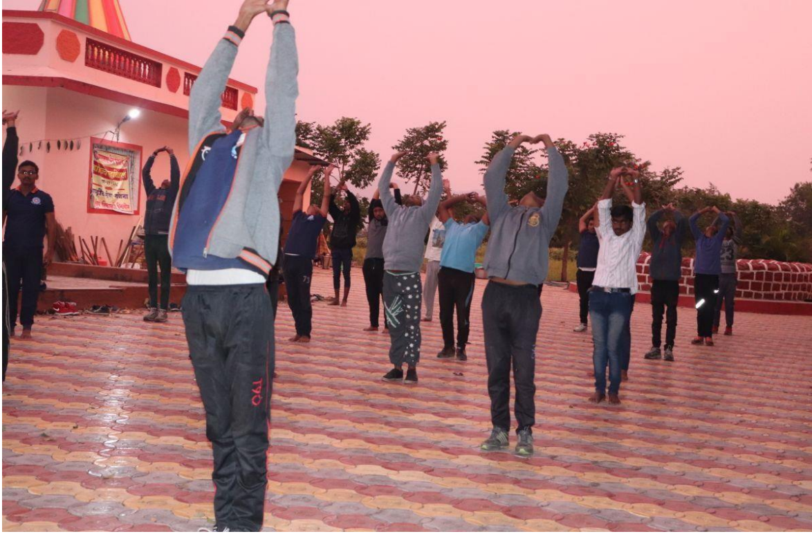
Students and faculty members observing International Yoga Day