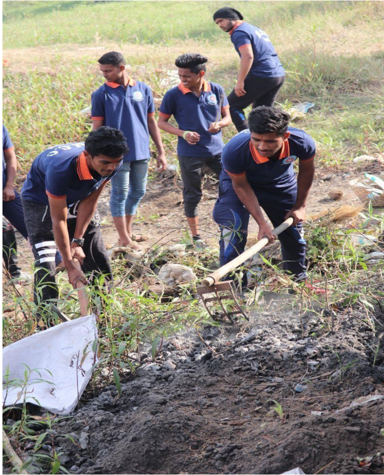
NSS volunteers clearing debris in order to plant trees