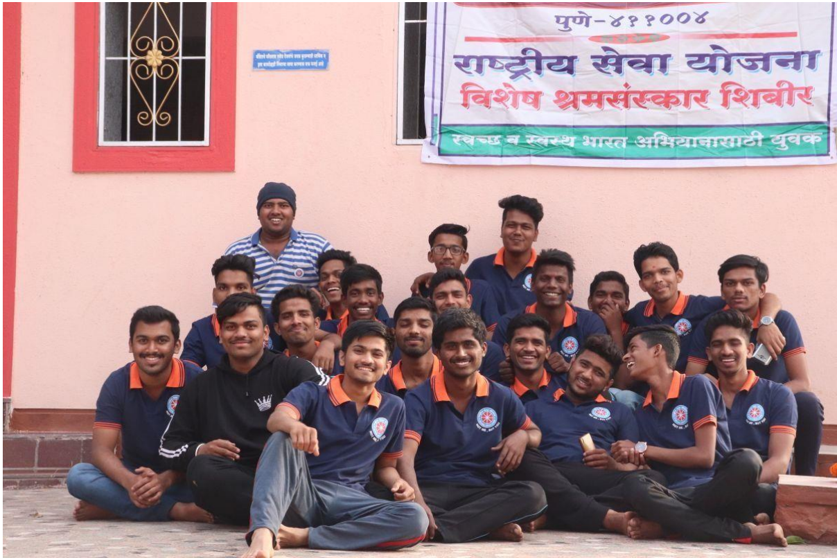
NSS volunteers at the special winter camp