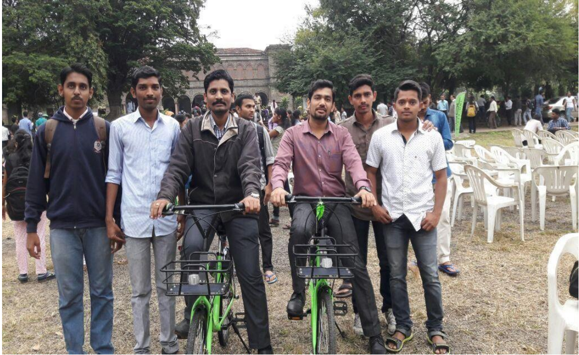
MMCC NSS unit at the Aids Awareness Rally held on 31st December 2018, World AIDS Awareness Day.