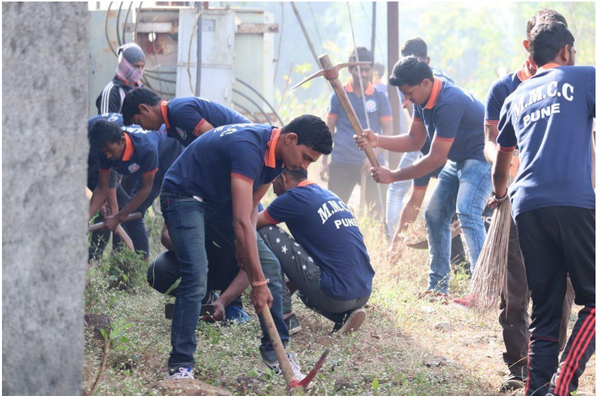
NSS Volunteers cleaning the premises on the occasion of Swachha Bharat Mission