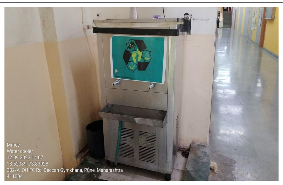
Drinking Water Facility