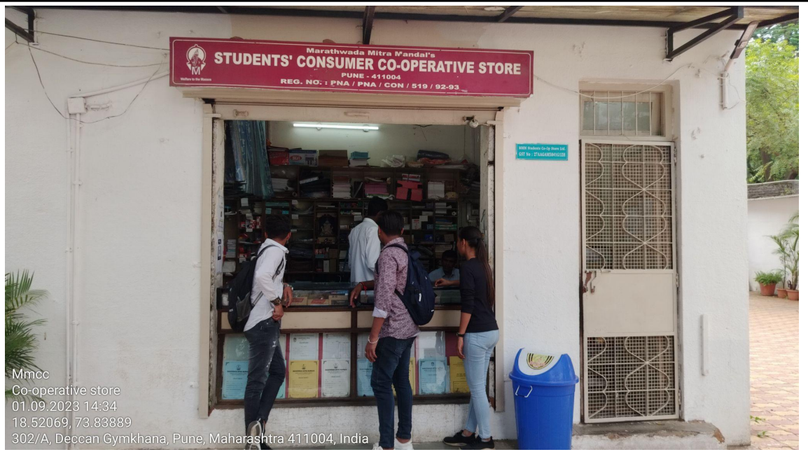
Students' Co-Operative Store