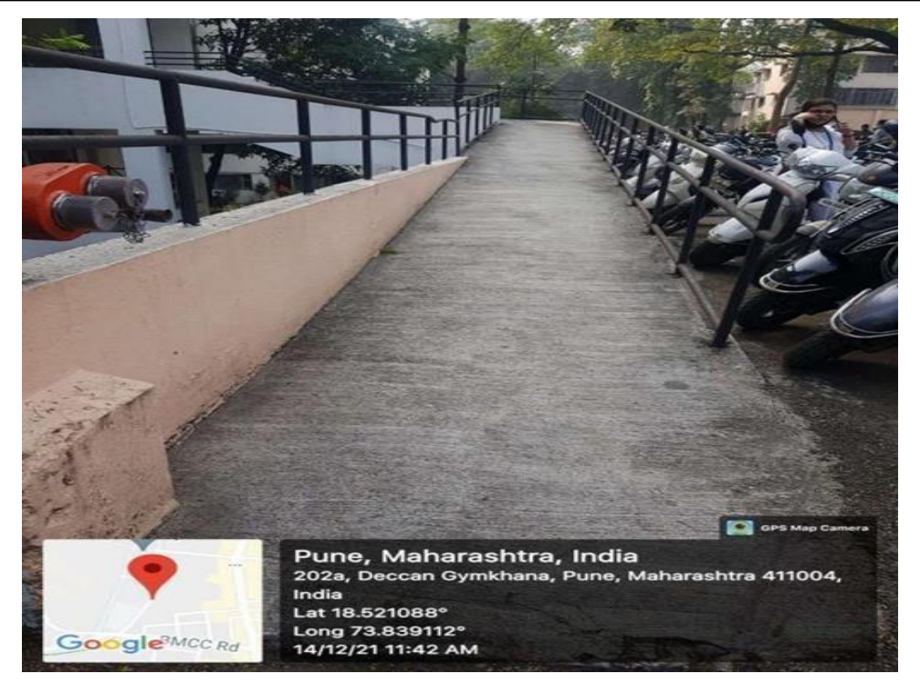
Ramp for the Divyangjan