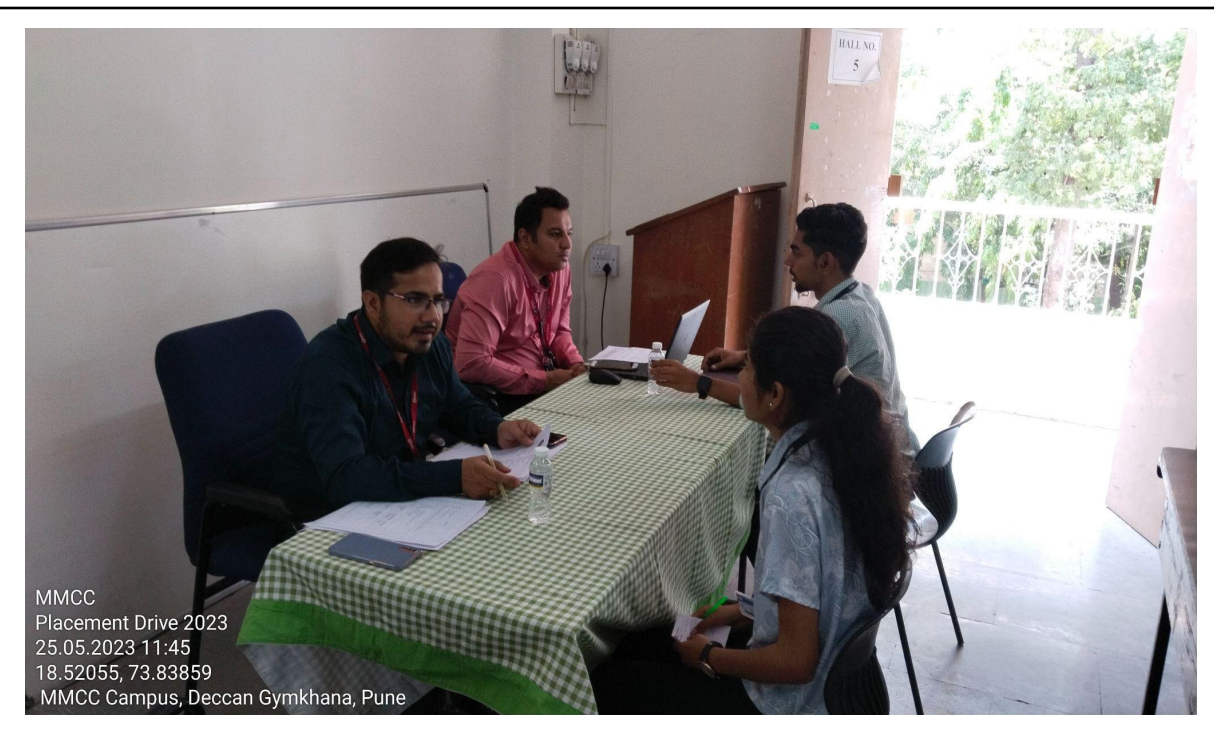
Interview Location in Campus for Placement Drive