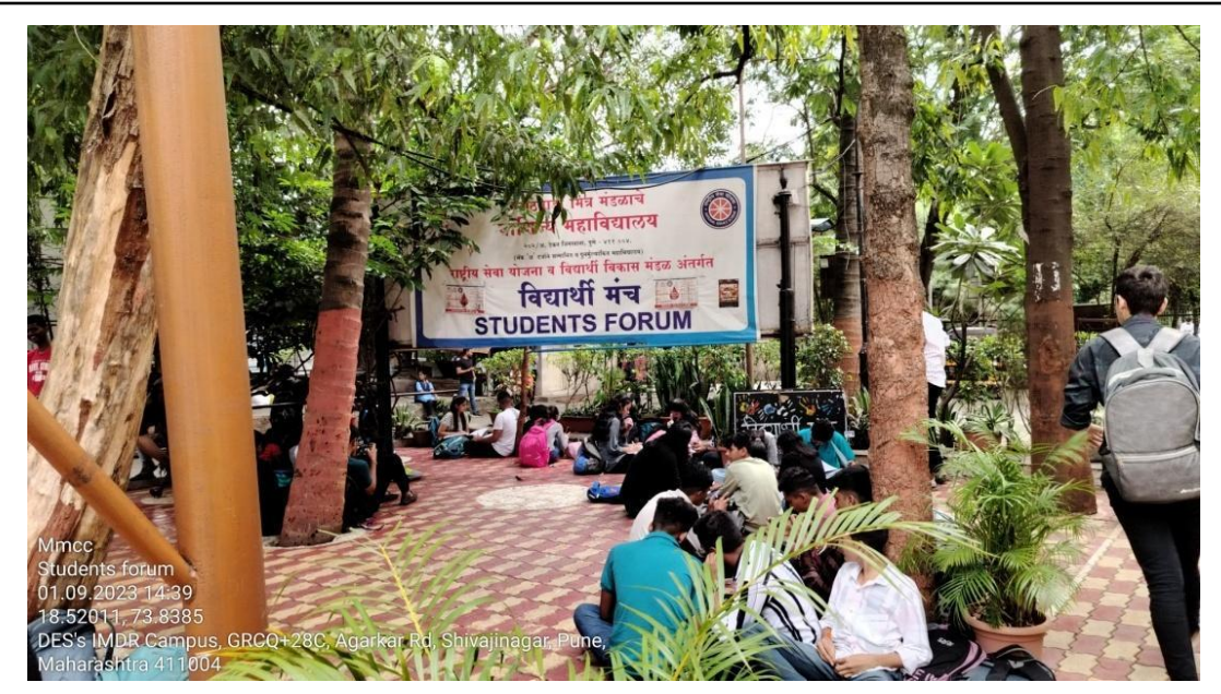
Area Designated as Students Forum for Various Activities