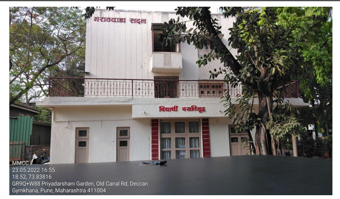
Boys Hostel in Campus