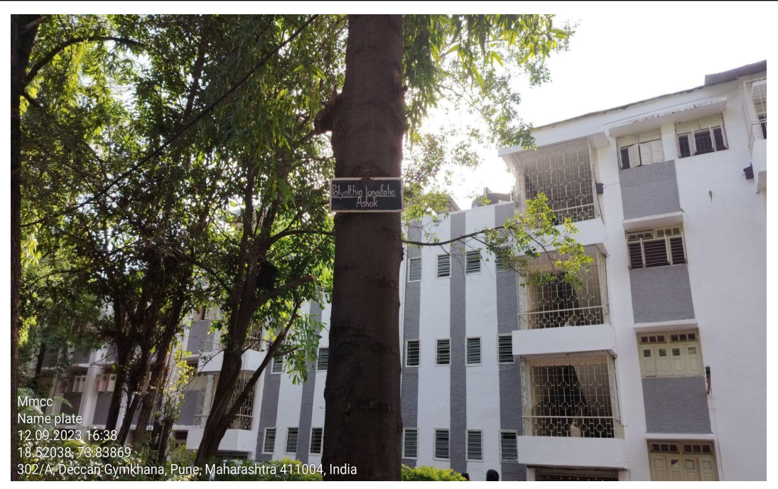
Plants with Name Plates in Campus