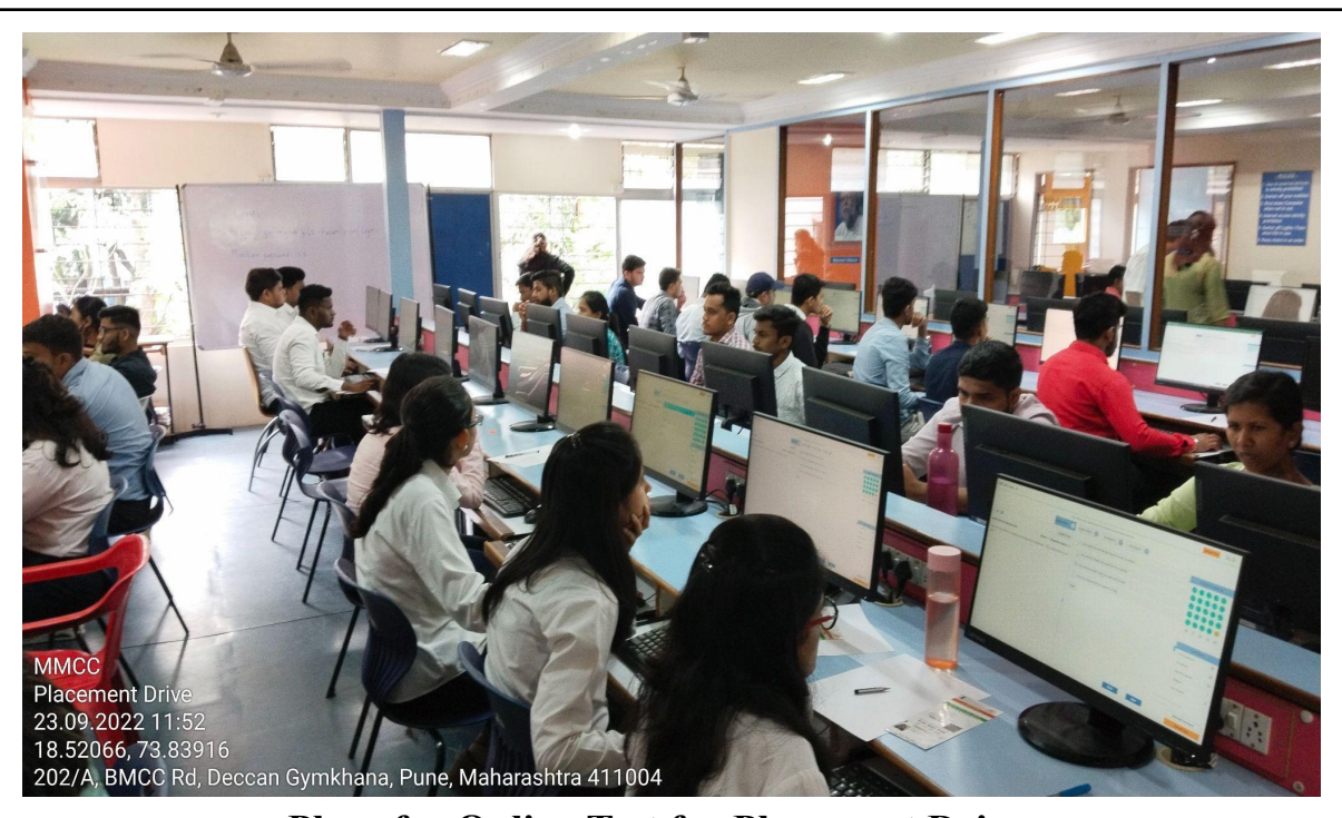
Place for Online Test for Placement Drive