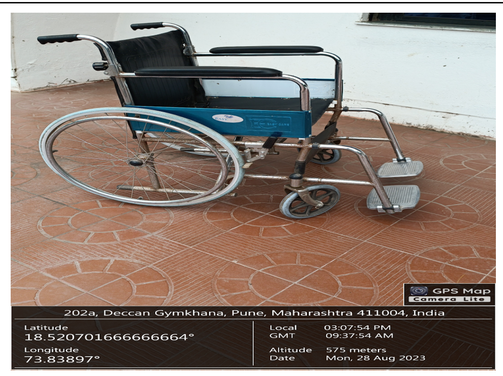
Wheelchair for Divyangjan