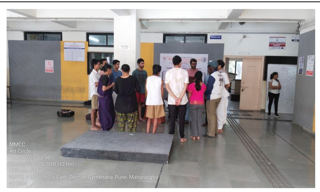
Open Lobby to Practice Drama