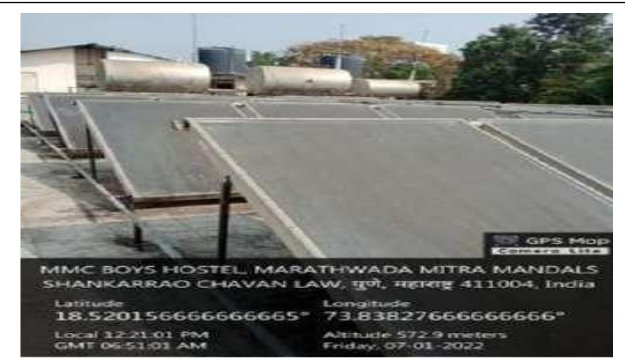
Solar Panel in Campus