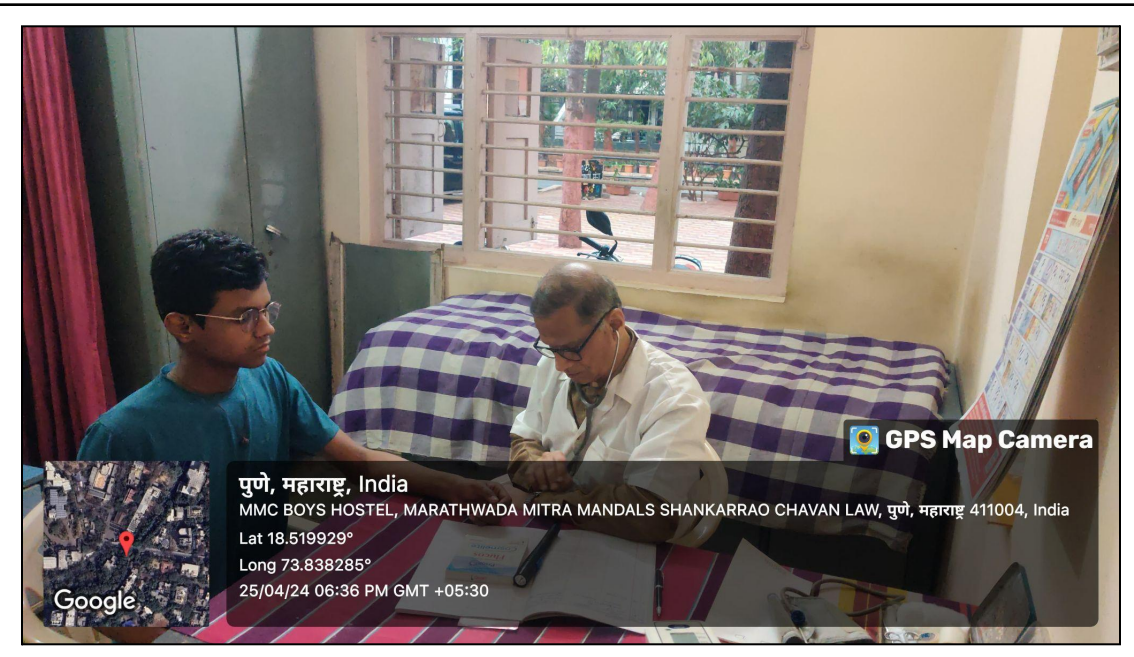
Medical Facilities in campus