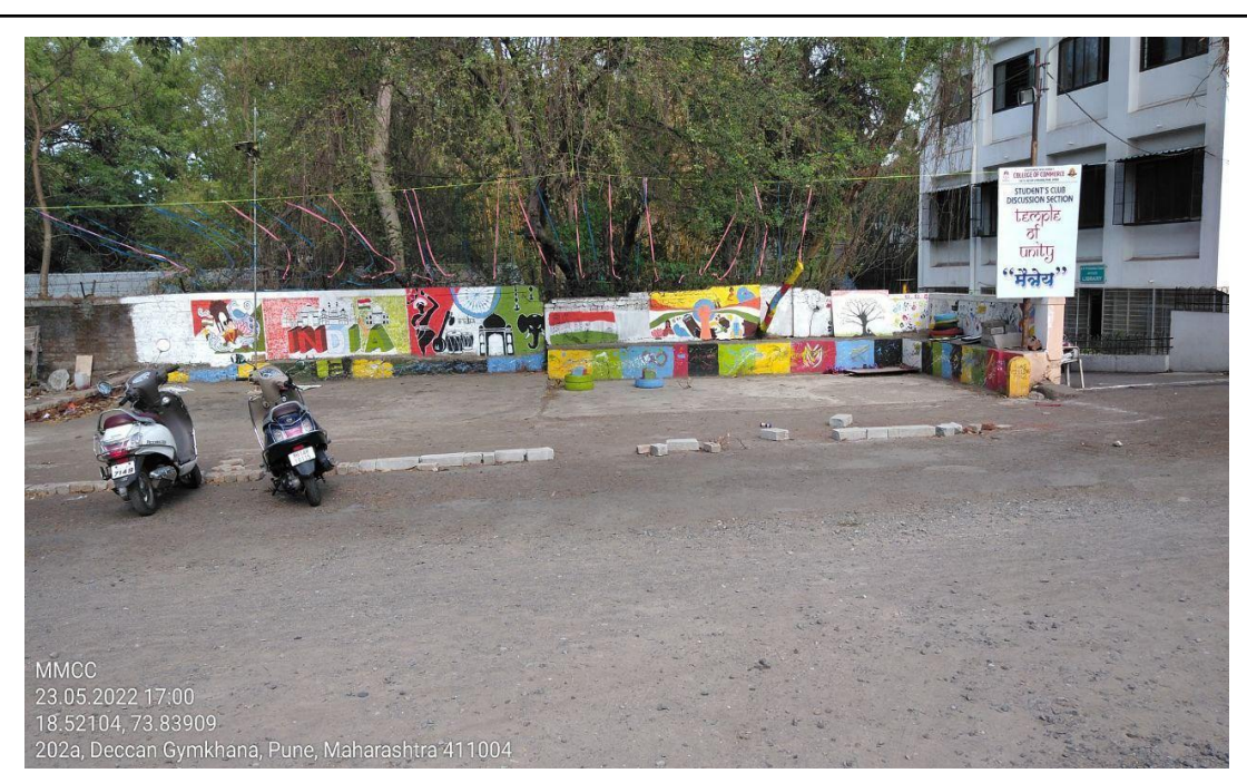
Open Area Designed as Maitrey Katta for Student Activities