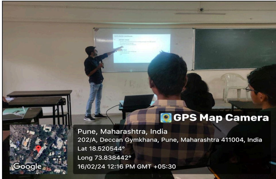
Lectures Conducted using IT Facilities