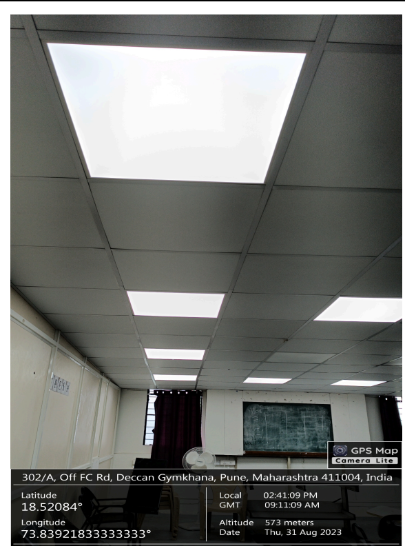
LED lights installed on campus for energy efficiency